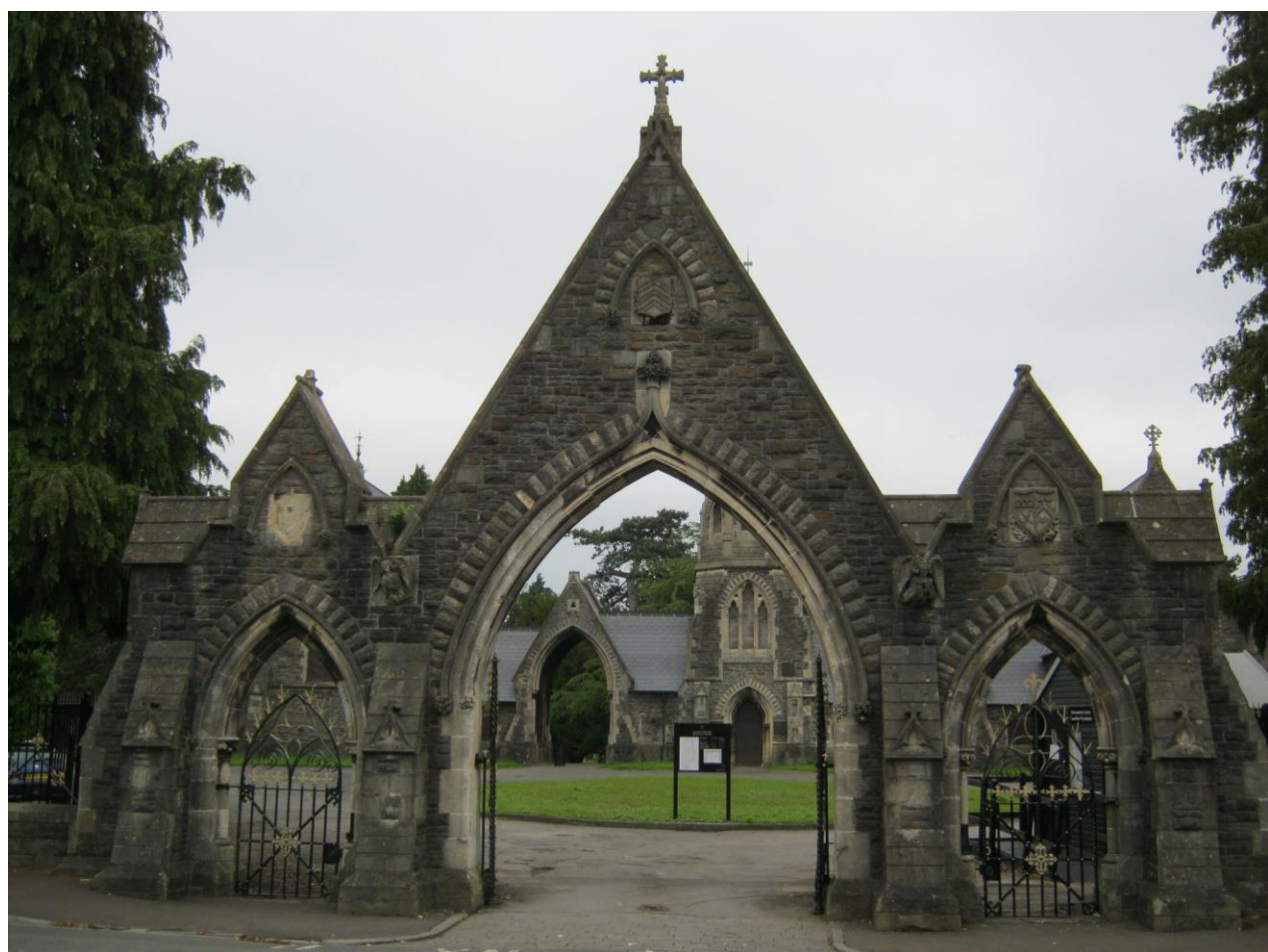
Entrance to Cathays Cemetery